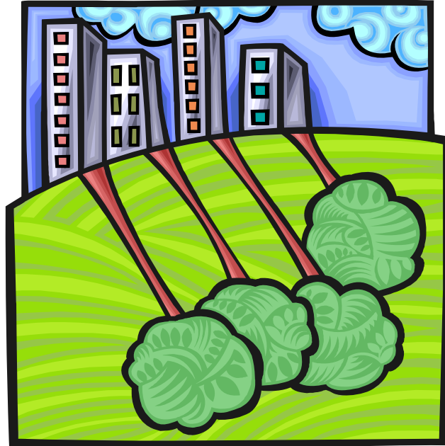
CHART ARRA 1A